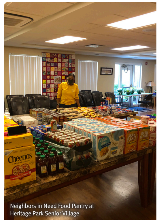
Neighbors in Need Food Pantry at Heritage Park Senior Village

Your generosity and kindness changed lives, and for that, you should be forever proud!